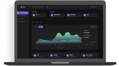
BUILDING OWNER PORTAL